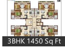
3BHK 1450 Sq Ft