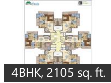
4BHK, 2105 sq. ft.