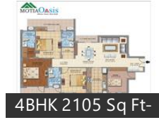
4BHK 2105 Sq Ft-