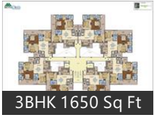
3BHK 1650 Sq Ft