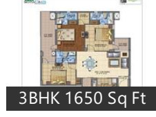
3BHK 1650 Sq Ft