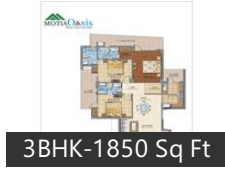
3BHK-1850 Sq Ft