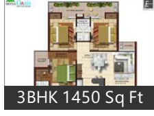
3BHK 1450 Sq Ft