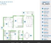
1750 Sq Ft

* These floor plans are of the project and might not represent the property