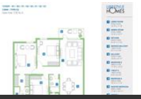
1735 Sq Ft