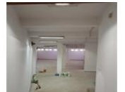
14 feet height