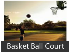
Basket Ball Court