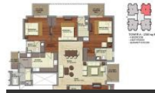
4BHK Floor Plan