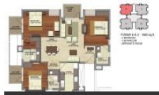
3BHK Floor Plan