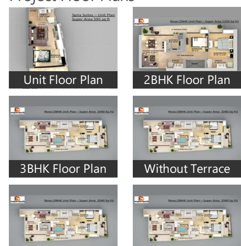
With Terrace Floor With Void Floor * These floor plans are of the project and might not represent the property