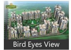
Bird Eyes View