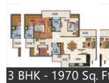
3 BHK - 1970 Sq. Ft.