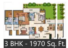
3 BHK - 1970 Sq. Ft.

* These floor plans are of the project and might not represent the property