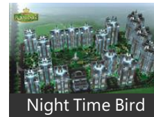
Night Time Bird