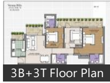
3B+3T Floor Plan