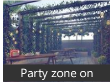
Party zone on