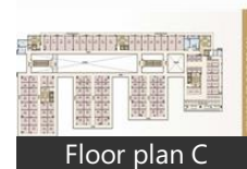
Floor plan C