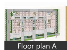
Floor plan A