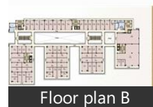
Floor plan B