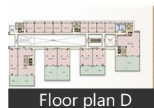
Floor plan D

* These floor plans are of the project and might not represent the property