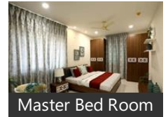
Master Bed Room