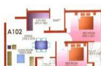
Deluxe A Floor Plan