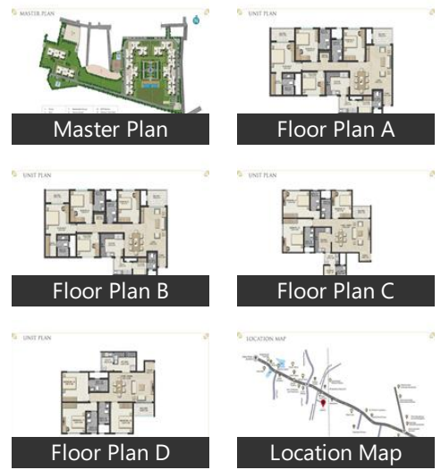
* These floor plans are of the project and might not represent the property

Disclaimer: The reviews are opinions of PropertyWala.com members, and not of PropertyWala.com.