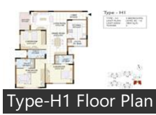
Type-H1 Floor Plan