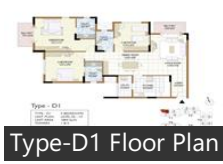
Type-D1 Floor Plan