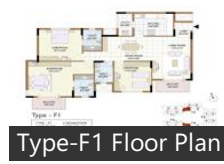
Type-F1 Floor Plan