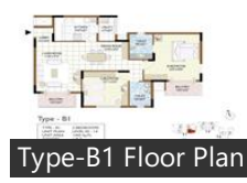
Type-B1 Floor Plan