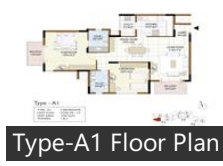
Type-A1 Floor Plan