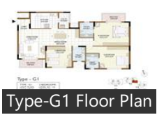
Type-G1 Floor Plan