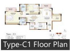
Type-C1 Floor Plan