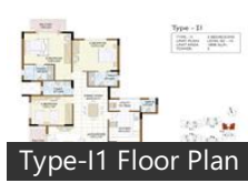
Type-I1 Floor Plan