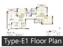
Type-E1 Floor Plan