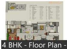
4 BHK - Floor Plan -