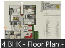
4 BHK - Floor Plan -