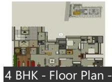
4 BHK - Floor Plan -