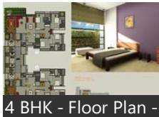
4 BHK - Floor Plan -