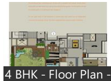
4 BHK - Floor Plan -