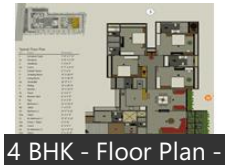
4 BHK - Floor Plan -