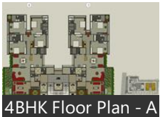
4BHK Floor Plan - A