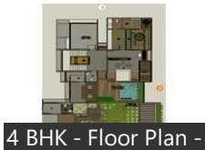
4 BHK - Floor Plan -