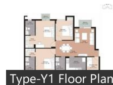
Type-Y1 Floor Plan

* These floor plans are of the project and might not represent the property