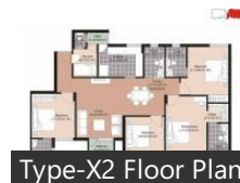
Type-X2 Floor Plan