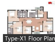
Type-X1 Floor Plan