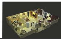
Isometric View of 3