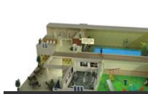
Isometric view of