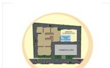
Site Plan Top View