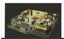
Isometric View of 2