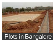
Plots in Bangalore