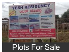
Plots For Sale