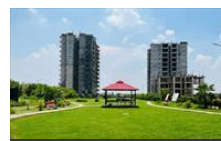
Leela Orchid Greens