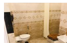
Leela Orchid Greens