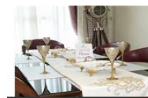
Leela Orchid Greens