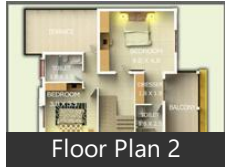
Floor Plan 2