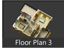
Floor Plan 3