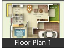
Floor Plan 1