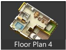
Floor Plan 4