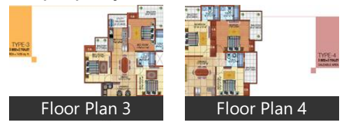
* These floor plans are of the project and might not represent the property