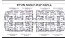
Floor Plan H