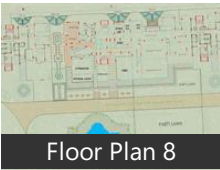
Floor Plan 8