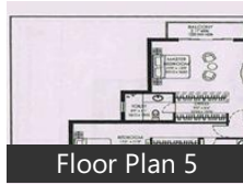
Floor Plan 5