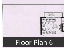
Floor Plan 6