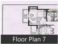
Floor Plan 7