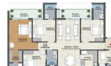
Floor plan A