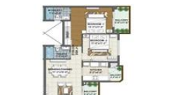
Floor Plan D

* These floor plans are of the project and might not represent the property