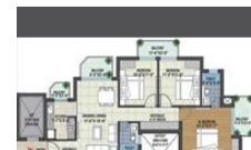
Floor Plan C