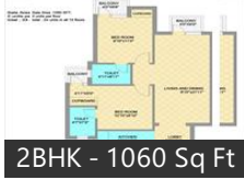
2BHK - 1060 Sq Ft