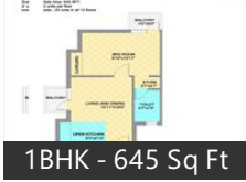
1BHK - 645 Sq Ft