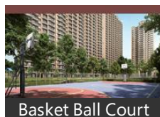
Basket Ball Court