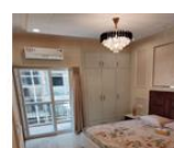
Master Bed Room