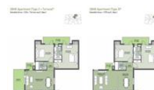
2 BHK - 1234 to