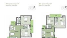
2 BHK - 1234 Sq Ft