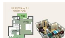
1 BHK - 625 Sq Ft