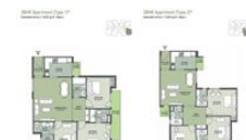
3 BHK - 1620 Sq Ft

* These floor plans are of the project and might not represent the property