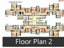
Floor Plan 2