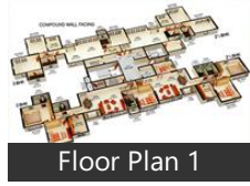
Floor Plan 1