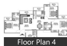
Floor Plan 4

* These floor plans are of the project and might not represent the property