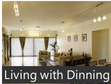
Living with Dinning