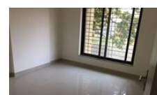
Master Bed Room