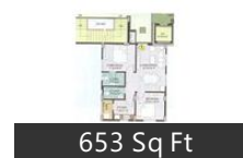
653 Sq Ft