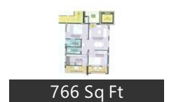
766 Sq Ft