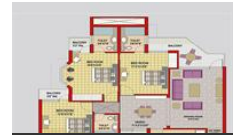
Floor Plan 5

* These floor plans are of the project and might not represent the property