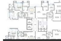
Daisy Juy Floor Plan