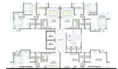
Daffodil Floor Plan