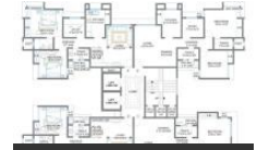
Lily Floor Plan

* These floor plans are of the project and might not represent the property