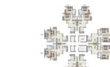
2 BHK Type B