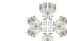
2 BHK Type A