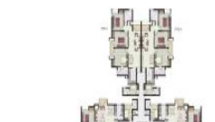
3 BHK Type B

* These floor plans are of the project and might not represent the property