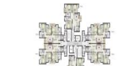
3 BHK Type A