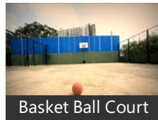
Basket Ball Court