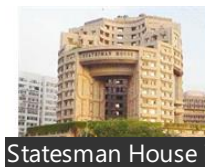
Statesman House in