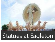
Statues at Eagleton