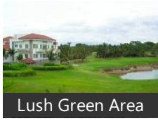
Lush Green Area