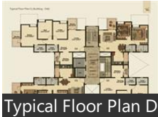
Typical Floor Plan D