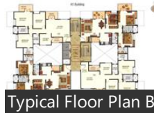
Typical Floor Plan B