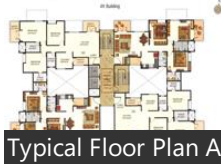
Typical Floor Plan A