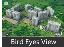
Bird Eyes View