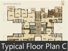
Typical Floor Plan C