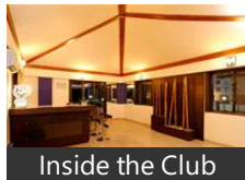
Inside the Club