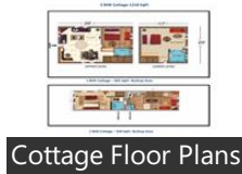
Cottage Floor Plans