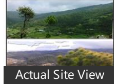
Actual Site View