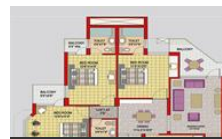
Floor Plan 2