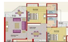
Floor Plan 1