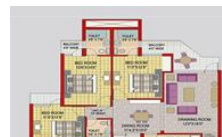
Floor Plan 4