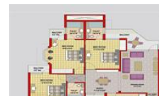
Floor Plan 5

* These floor plans are of the project and might not represent the property