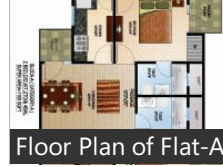
Floor Plan of Flat-A