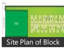
Site Plan of Block