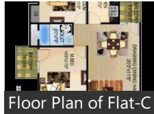
Floor Plan of Flat-C