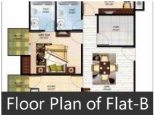
Floor Plan of Flat-B