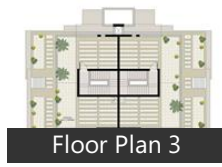
Floor Plan 3