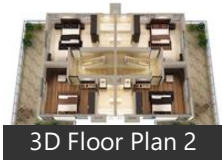
3D Floor Plan 2