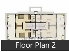
Floor Plan 2