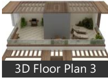
3D Floor Plan 3