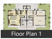
Floor Plan 1