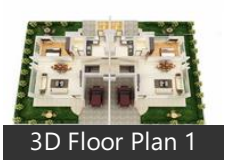
3D Floor Plan 1