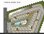
Typical Floor Plan

* These floor plans are of the project and might not represent the property