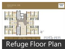
Refuge Floor Plan