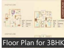
Floor Plan for 3BHK