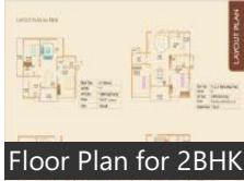
Floor Plan for 2BHK