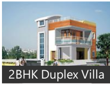
2BHK Duplex Villa