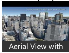
Aerial View with