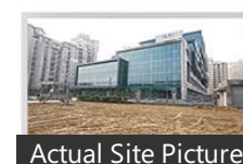
Actual Site Picture